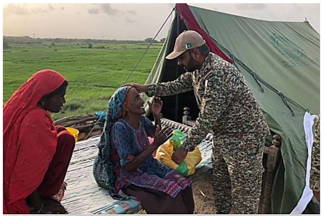
Pakistan Navy Officer providing relief goods to flood affected people in Mirpur Khas, Sindh